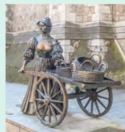
Molly Malone Statue, Dublin, Ireland

The Hill of Tara is an ancient ceremonial and burial site in County Meath, Ireland. Tradition identifies the hill as the inauguration place of the High Kings of Ireland; it also appears in Irish Mythology. Tara consists of numerous monuments and earthworks — dating from the Neolithic to the Iron Age — including a passage tomb “the Mound of the Hostages”, burial mounds and a standing stone believed to be the “Lia Fáil” or “Stone of Destiny”. Tara forms part of a larger ancient landscape protected by the government.