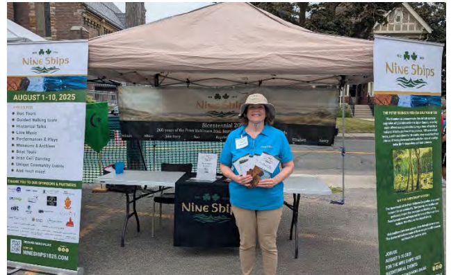
New Canadian Centre Block Party

On some occasions we shared a booth and signs.