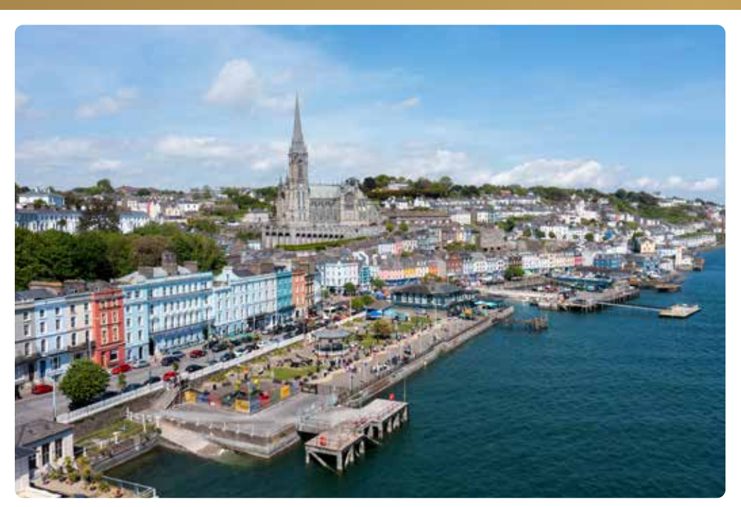
200TH ANNIVERSARY WREATH LAYING CEREMONY IN COBH, IRELAND