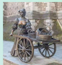
Molly Malone Statue, Dublin, Ireland

They set sail from Cobh Harbour, Cork, Ireland