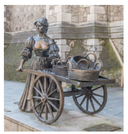
Molly Malone Statue, Dublin, Ireland

It's just before 1825. An Emigration notice has appeared in the Irish Times. Word is spreading quickly throughout the Blackwater Valley in County Cork and beyond. How many people will apply for this experimental scheme?